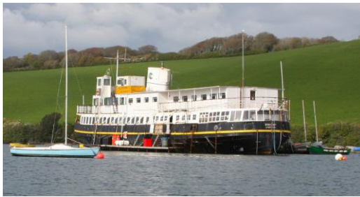
The ICC and Egremont. (Chart Point 6)

Egremont is an ex Mersey ferry, but now offering shower facilities and a bar to visiting boaters over the weekends.