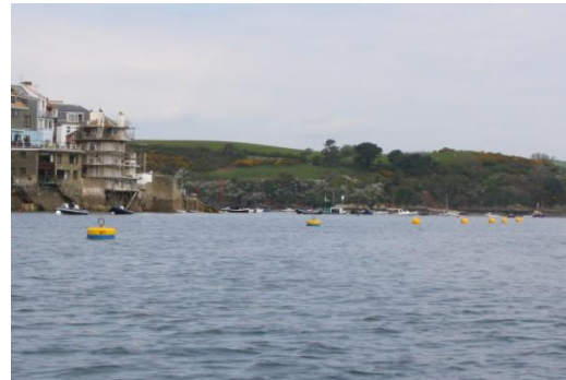
Two visitors' buoys and five fairway buoys; keep to the west of them when swarms of dinghies (Chart point 2)

Salcombe has two pontoons: Normandy pontoon has water and berthing limited to ½ hour; visitors can moor inside.