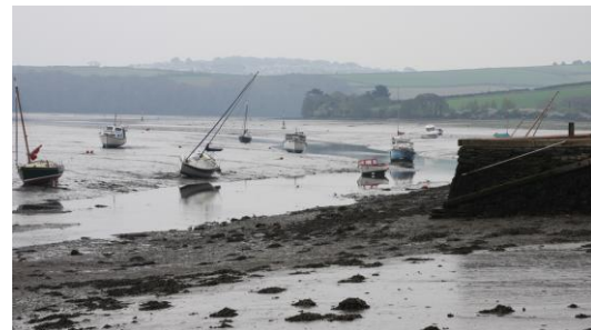
Final approach to Frogmore. Visitors pontoon to starboard. (Chart point 9)