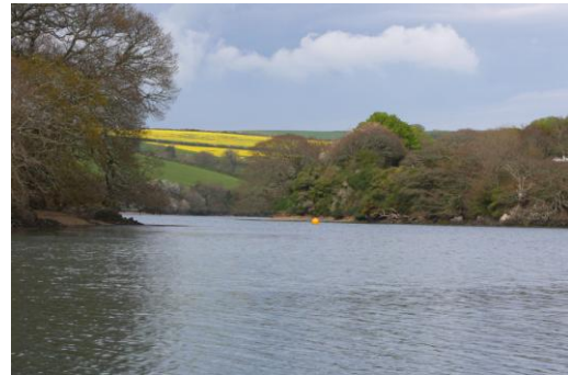
South Pool Creek; good watching but watch your wake.

The creek is not marked by posts but the age old rule of ‘deep water follows the outside of a bend’, keeps you away from the shallower bits.