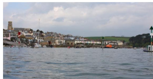
Starboard posts leading to Salcombe.

Whitestrans pontoon is used by commercial operators and the inside is mostly used by Salcombe mooring holders.