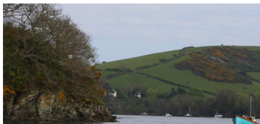
Scoble Point at the start of South Pool Creek (Chart point 4).

Heading East finds South Pool Creek entrance. The creek is a great place to explore in a dinghy on the tide for first timers. Scoble Point marks the Northern side of the Creek, initially deeper water lies to the South following the moorings.