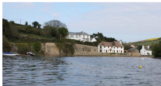
Visitor pontoon at South Pool (Chart point 5)

On reaching South Pool, the visitors pontoon to port is accessible two hours either side of high water. The award winning gastro pub, the Milbrook Inn is a short walk.