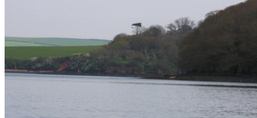
Looking East into Frogmore Creek at LW. Hawell Point to starboard. (Chart point 7)

An anchorage lies just upstream of Halwell Point at the entrance to Frogmore Creek. Stay closer to Halwell Point as this southern bank initially offers deeper water.