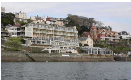
Salcombe Harbour Hotel. (Chart point 2)

Small yellow fairway buoys mark the eastern edge of a channel useful for all water users when dinghy racing obscures the main estuary.