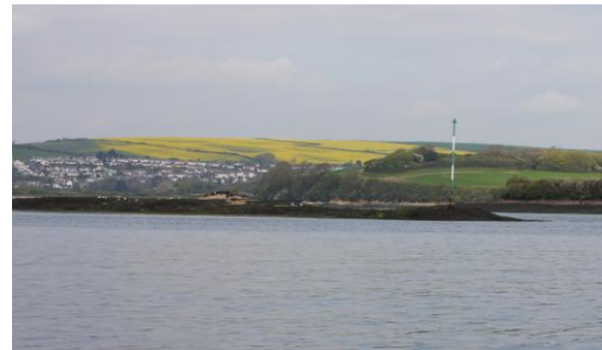
Saltstone visible at LW. Starboard marker indicating the Kingsbridge channel and not Frogmore Creek (Chart point 8)

Note: The Saltstone is a distinctive rock with a starboard post on top. It’s North of the Frogmore Creek and marks the starboard side of the estuary and not the starboard side of Frogmore Creek.