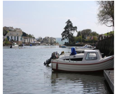
Looking North to Kingsbridge and South from the visitor pontoon. (Chart point 12)