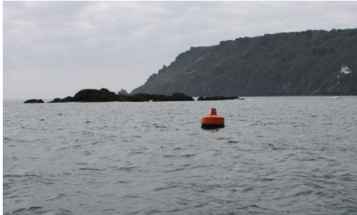
Looking South West to Black Rock at LW. (Chart point 1)

After crossing Salcombe Bar, four new lit buoys mark the channel as it rounds Black Rock. Heading North East towards Salcombe and passing Sunny Cove anchorage on the eastern bank, the Salcombe Estuary beckons.